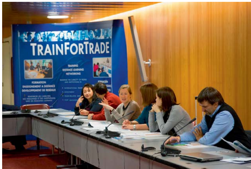
Geneva, CIGG, 10 December 2013

Developing skills, knowledge and capacities through innovation: E-learning, M-learning, Cloud-learning